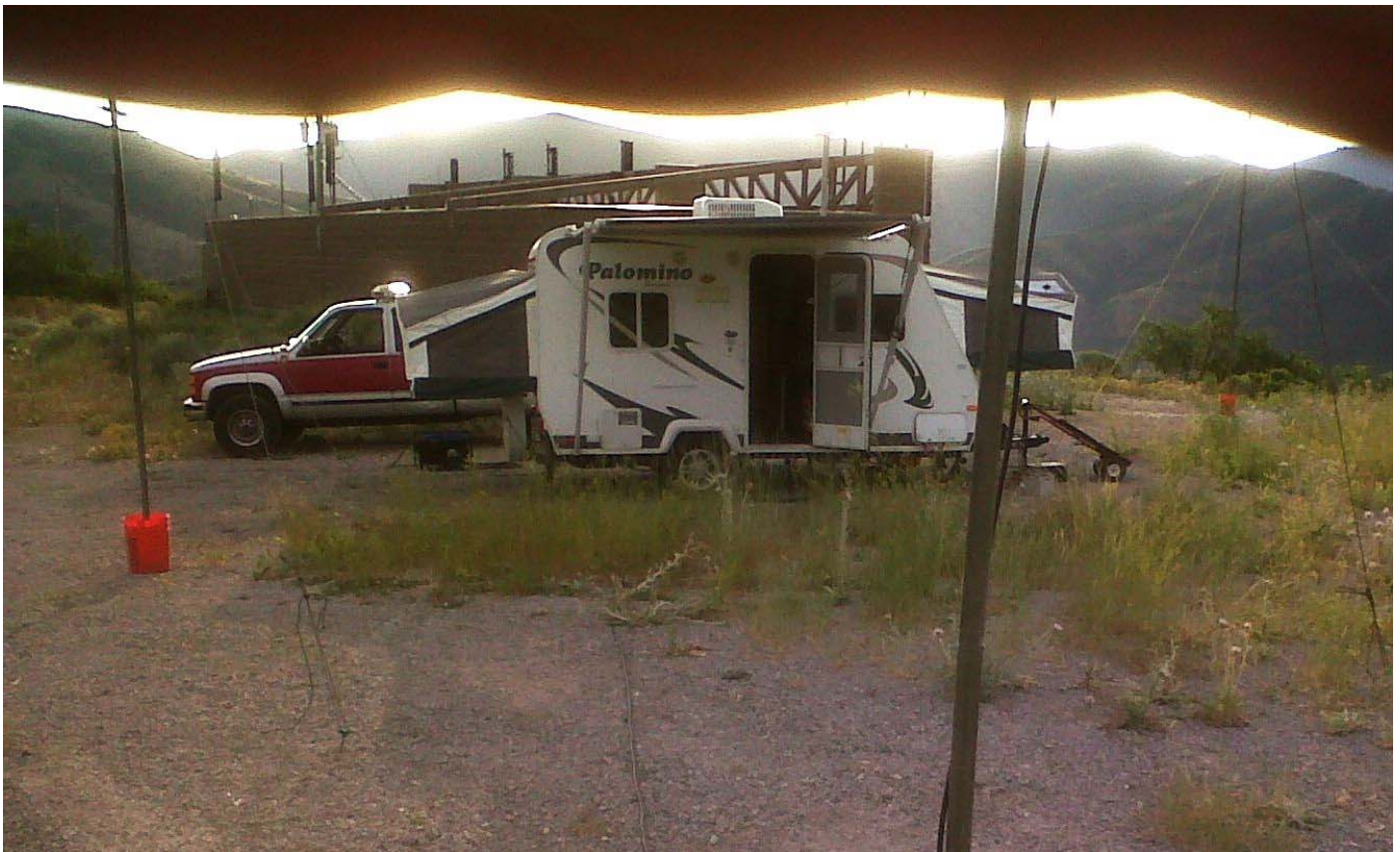
Net Control site for the July 25 Marathon

During the early morning hours on July 25, the Deseret Morning News Marathon, 10k, and 5K