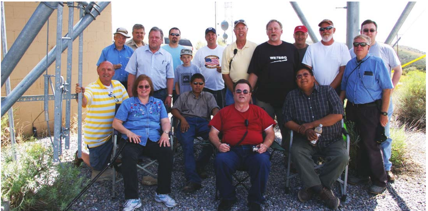
On Saturday, August 20, an entire bevy (or is it a gaggle?) of hams assembled on Lake Mountain, site of UARC's 146.76 repeater, as a picnic of the "76ers" coincided with efforts by KA7OEI and K7HFV to replace the repeater's link receiver. Here, the group assembles under the tower. We leave it as an exercise for the viewer to identify the individual participants.